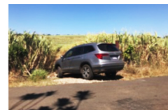
Entrada principal a la finca