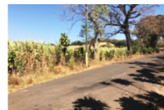
Frente de propiedad